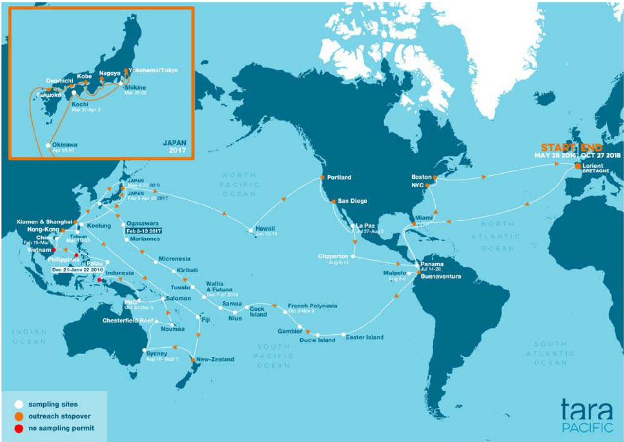
Fig. 1 | Tara Pacific expedition map (2016–2018) with sampled coral systems (white circles).

three animal biomes (coral, fish, and plankton) geographically. These microbiomes were species-specific and differed from those of the planktonic communities. Surprisingly, these microbiomes did not follow the well-known diversity gradients seen for corals 8 . Within the coral microbiota, Endozoicomonadaceae , a globally distributed bacterial family, has been identified as a key bacterial symbiont of corals. A specific analysis of this taxon has now shown that the same clades are found across the Pacific Ocean but are host-specific at the species level and may harbor different specific functions 9 . We also show that within a coral genus,